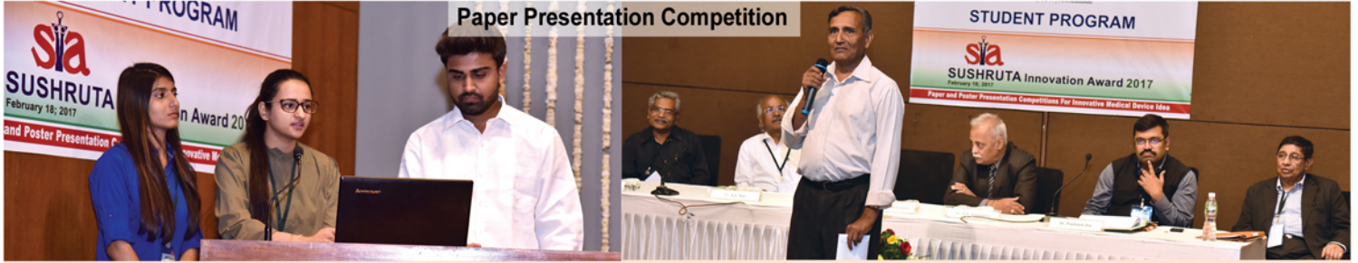
Paper Presentation Competition