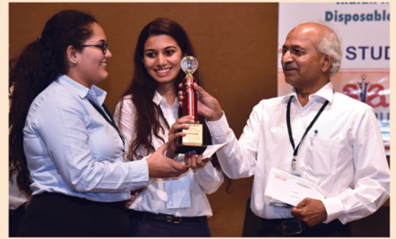
Students Participating Industry Conference